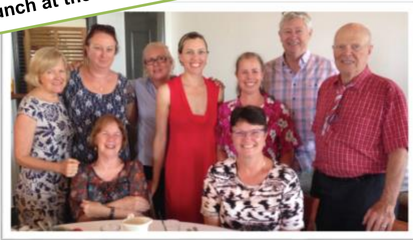
We had a birthday lunch at the Railway