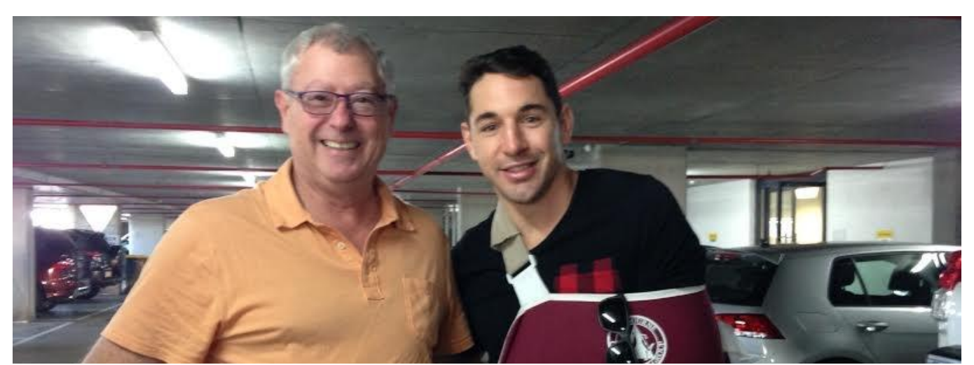
Glen was fortunate enough to meet Billy Slater (thankfully Queensland won the State of Origin).