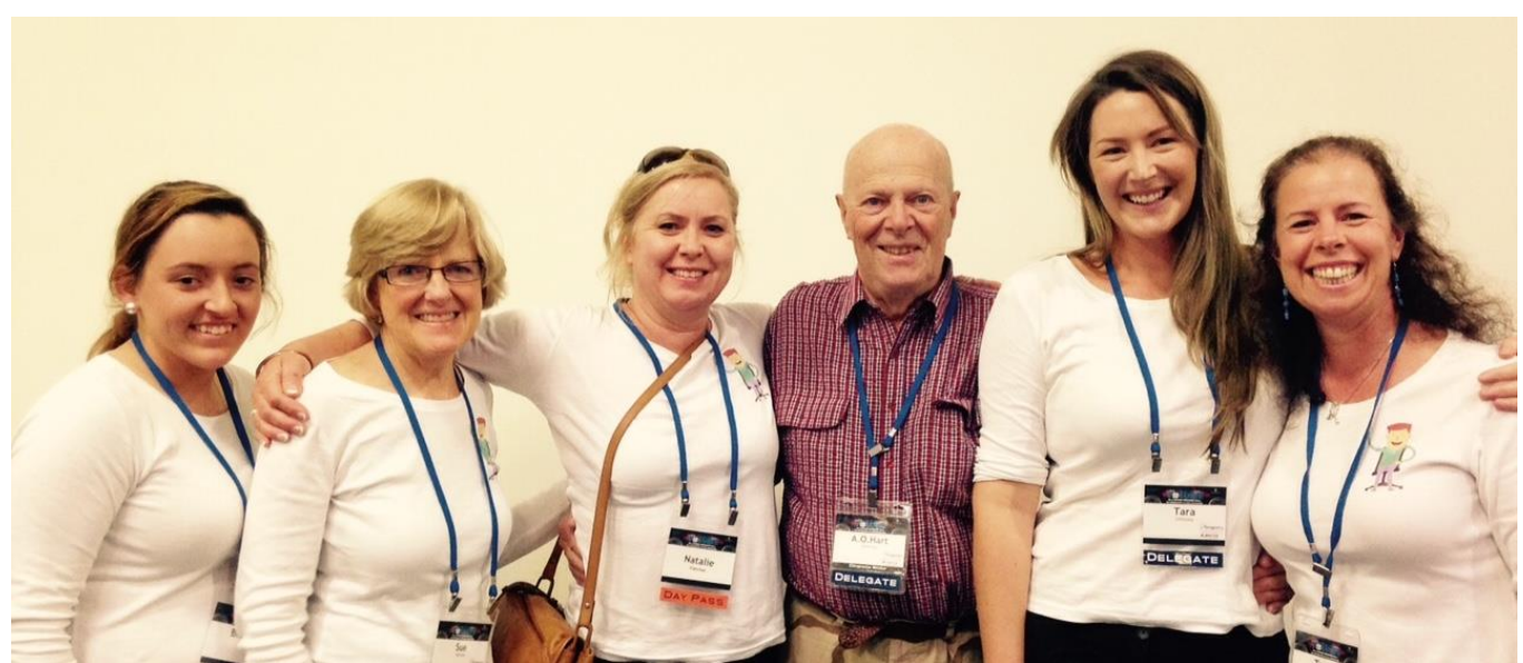
The whole Kennedy Chiropractic Centre team went to the Gold Coast for the International Parker Seminar. This annual even covers all thing chiropractic; continuing education for the chiropractors, special sessions for the students, and training sessions for the chiropractic assistants. Also there are fun social events so we can let our hair down at the end of the day.